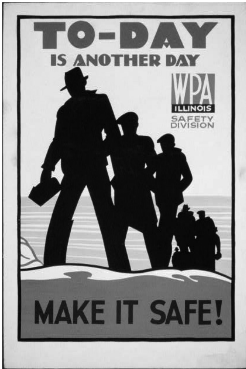
Work Projects Administration Poster