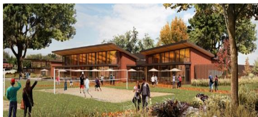
Rendering of Cleveland Commons Dining Hall

In instances like these and others, annual Memorial Building circa 1928. Where does the time go? gifts from Whitman alumni help students weather the financial setbacks that natural disasters and other unforeseen hardships could have on Whitman students and their families. If you haven't yet given for the 2018-19 fiscal year, please join us in doing so! And if you aren't sure if you've given or not this year, there's always extra kudos for giving again or setting up a recurring gift, pledge or corporate gift match! Visit whitman.edu/give to easily check this off your to-do list!