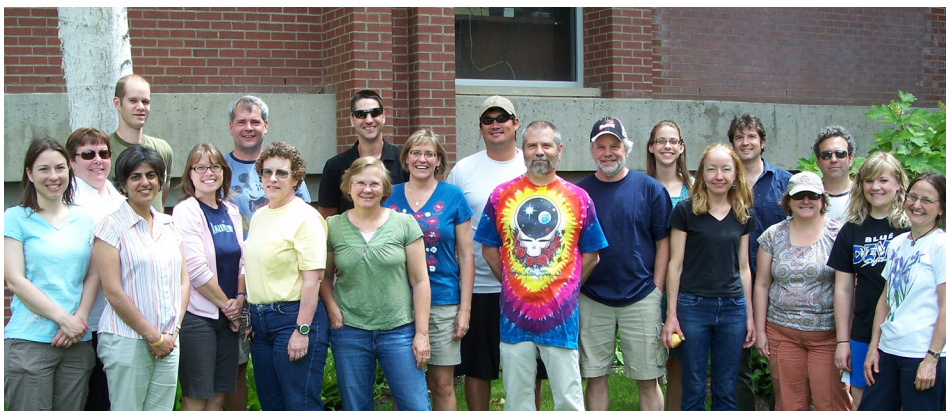
Local science educators and Whitman presenters gather for the 2012 HHMI Summer Institute.