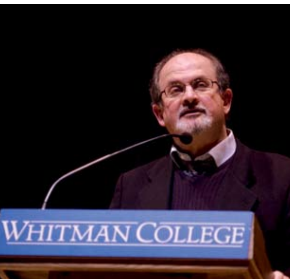
Salman Rushdie spoke at Whitman in November.

His visit to campus was sponsored by the Associated Students of Whitman College, the Whitman Intercultural Center and the President's Office.