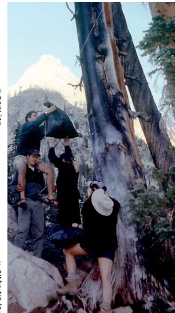
(Above) In this undated photo, Scrambles participants use teamwork to hoist a gear bag into a tree to keep their food away from bears.