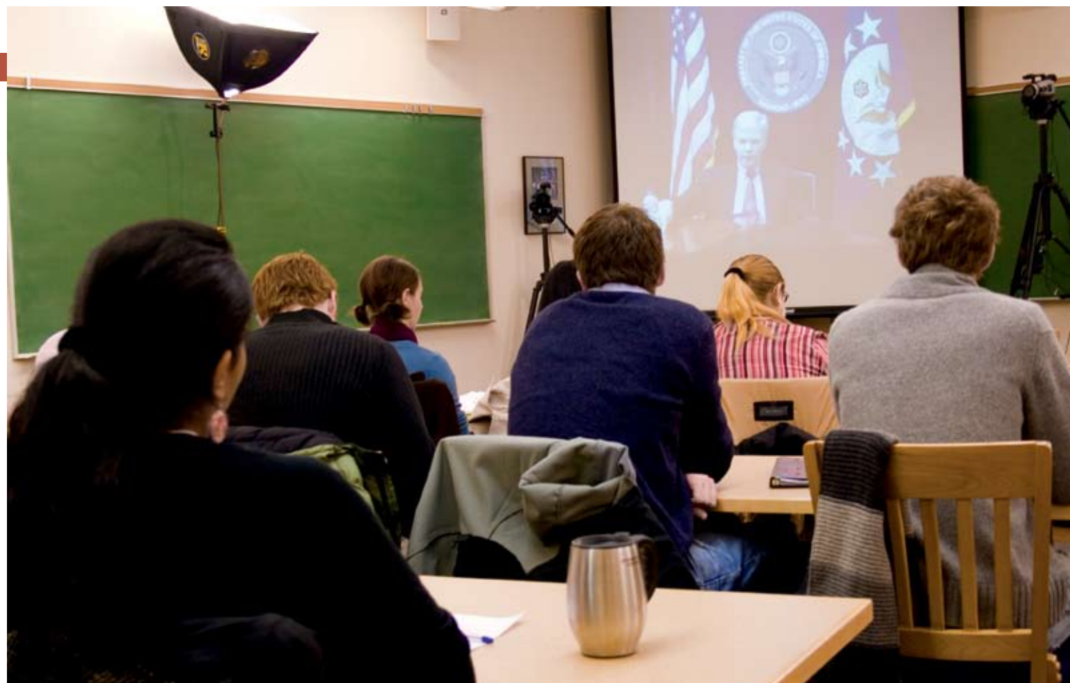
Students in a politics class on the Iraq War talked to Ryan Crocker '71, U.S. ambassador to Iraq, in November via videoconference.