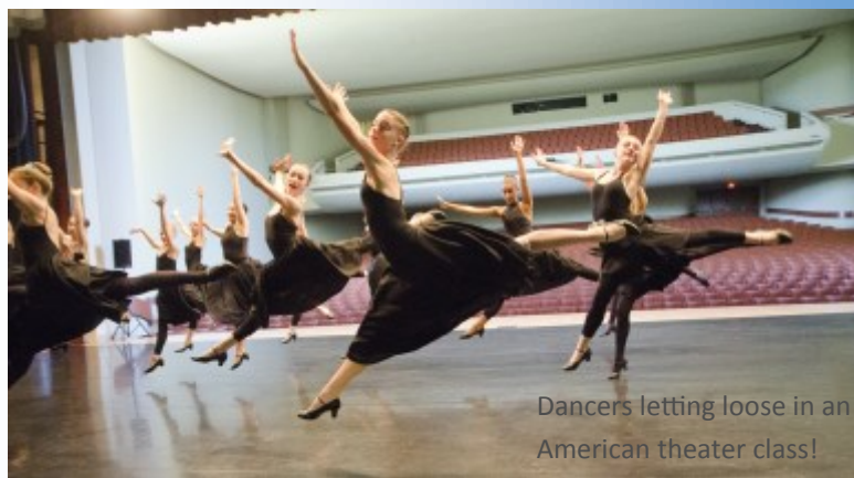
Dancers letting loose in an American theater class!